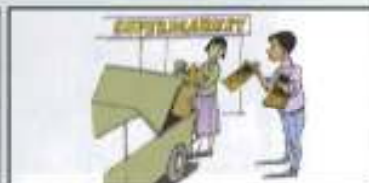
distribute some flyers