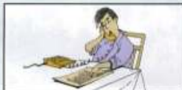
make a few phone calls