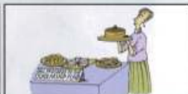
bake something for the bake sale