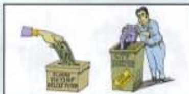
make a donation