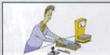
mail some letters