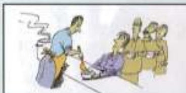
volunteer some time